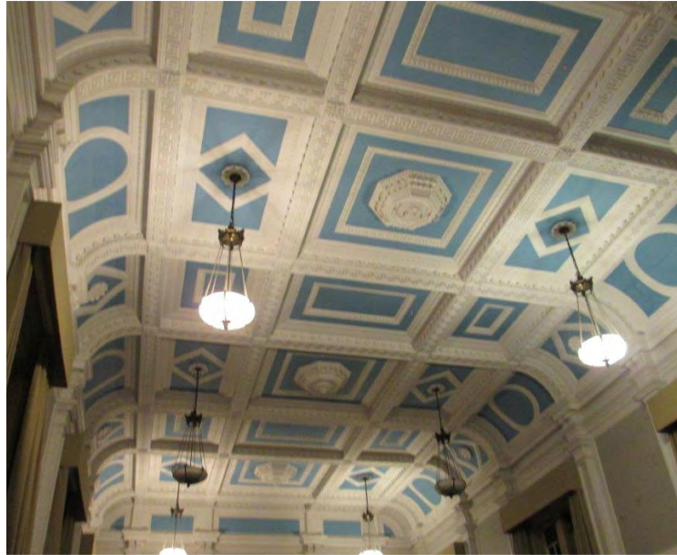
Royal Holloway's ornate architecture and the blue and white ceiling in Founders' Hall, Royal Holloway.

But to what you want to know: what speakers were there, and what did we think of them?